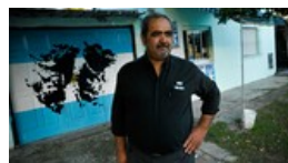
Talk Radio Gives Voice to Falklands Veterans