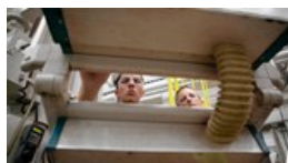
Germany's New Export: Jobs Training