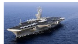
Navy Sails to Greener Future