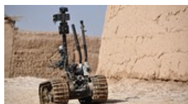
In Afghanistan, a Little Robot Can Be a Soldier's Best Friend